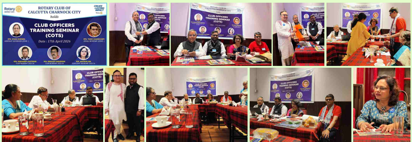
550th Regular Meeting and COTS

The meeting will be followed by the regular project of distribution of education materials to Swapnochowa and Awareness program on menstrual hygiene.