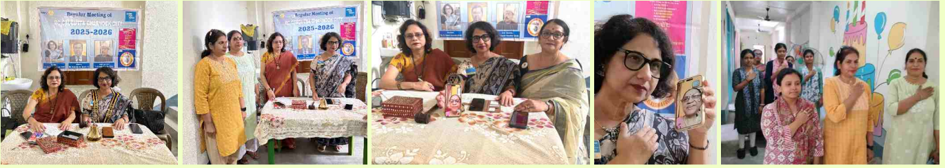
551st Regular Meeting