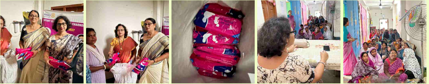
World Menstrual Hygiene Day in 28th May