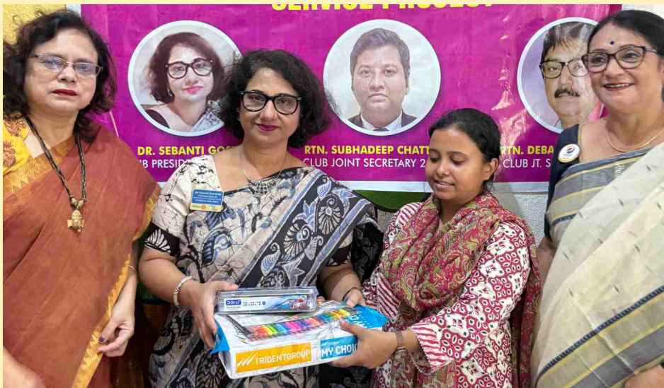
Monthly Support to Swapna Choya Model School at Joka for the Month of May