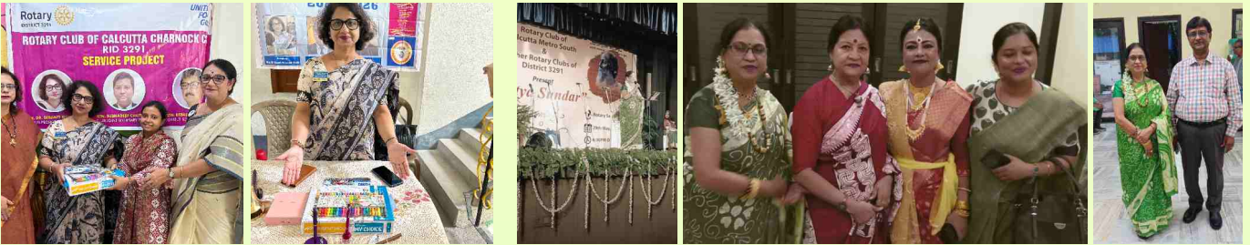
Presentation of the monthly requirements of Swapna Choya Model School at Joka