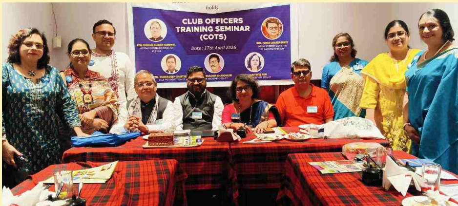
COTS on 17th May 2026